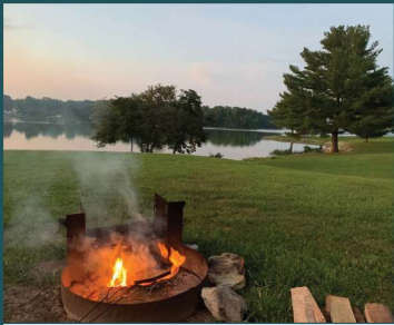
Parks and Green Space

PLEASE PLACE A STICKER DOT WITHIN THE BOXES OF THREE PHOTOS THAT BEST ECHO THE TYPE OF RECREATIONAL OPPORTUNITIES MARTIN COUNTY NEEDS MORE OF.