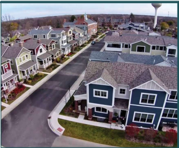
Farm House/Rural Cabin