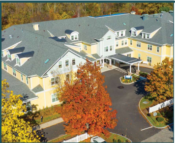
Senior Housing/Assisted Living