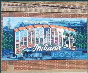
Cultural and Arts Spaces