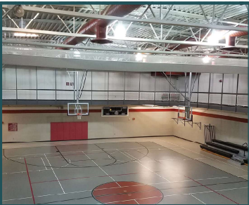
Community Recreation Center